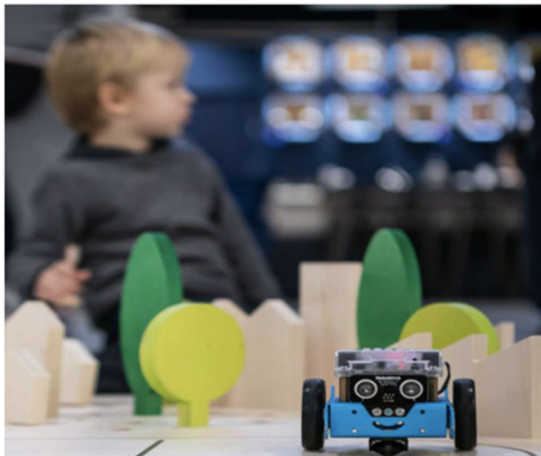
Figure 2: The Transportation of the Future, River Industries, 2019.