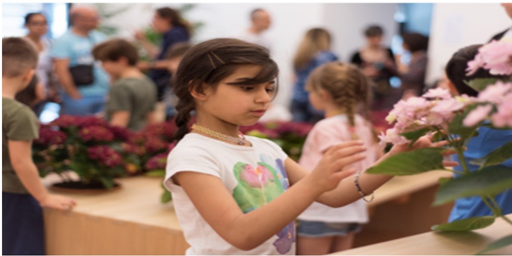
Figure 1: Alberi Bambini at Kids bit Festival, 2019.