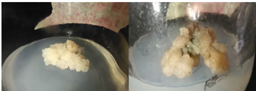
Figure 2: Light white to yellowish friable callus produced in vitro cultured leaf explants of Catharanthus roseus at MS medium with BA 0.3 mg/l and 2,4-D 0.75 mg/l hormonal combination.