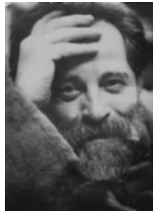
Figure 1: Ryzhkov Mark Nikolaevich (09/28/1935–12/15/1988).

September 28, 2025 marked the 90 th anniversary of the birth of the Ural pathologist, poet, translator of Armenian poetry into Russian, artist and sculptor Mark Nikolaevich Ryzhkov [1] (Figure 1,2).